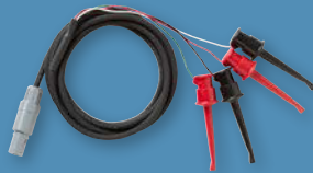
Universal RTD Adapter