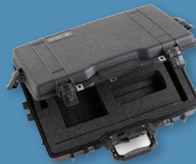
Probe and Readout Case