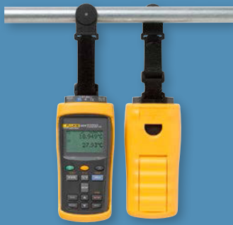
TPAK Magnetic Hanger